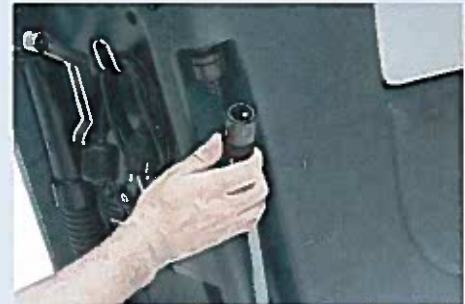
Solution hose is easy to disconnect and the solution tank can quickly be filled with water

The SC530 comes in two versions: Non-traction and traction. The traction version grants easier manoeuvrability and allows effortless driving control for the operator.