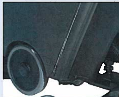
Built-in water level indicator.