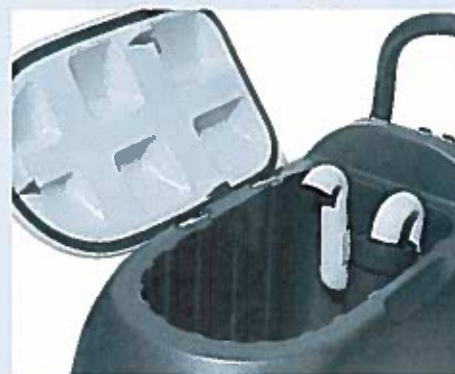
Large recovery tank and removable lid make it easy for you to clean and maintain the equipment. Fast and hygienic.

SC430 offers value for money and is available in a full package version that includes batteries, on-board charger as well as brush and squeegee – everything you need to get your cleaning going!