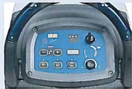
Solution flow regulation can be changed from the driving position according to the floor type and level of dirt